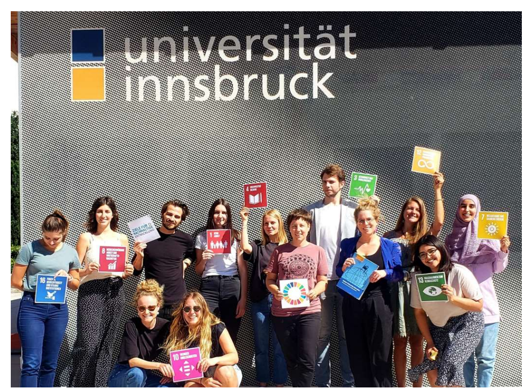
Interdisciplinary master seminar "Global Citizenship Education and Sustainable Development Goals", University of Innsbruck, March – July 2022