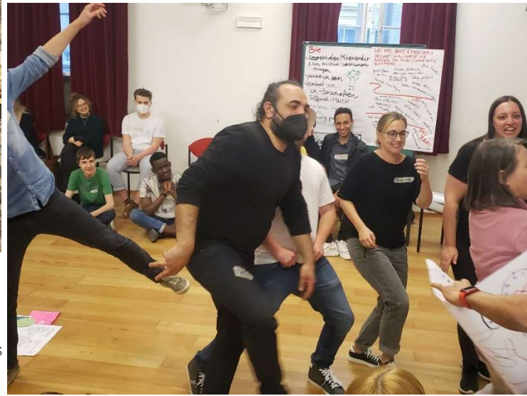
Conception and facilitation of an European youth seminar about "Diversity and youth participation", Italy – Germany – Austria, Focus: Design Thinking Client: Land Salzburg, Department of Social Affairs (online process + 3 days in Bressanone, Italy)