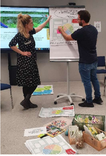
Seminar "International classroom: Global Citizenship Education", Winter 2022, Teacher University Tyrol