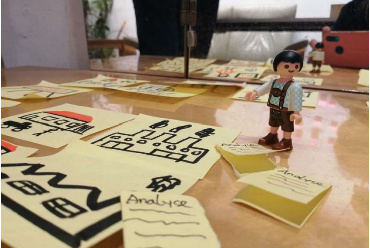
Design Thinking Workshop \, \hbox{``Education meets Social Work, Sept 2021, Innsbruck} \,