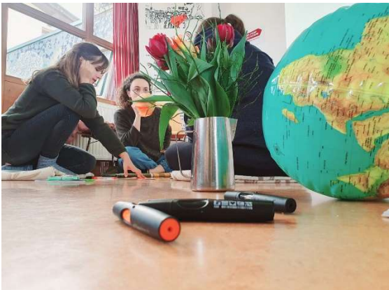
Conception and facilitation of a three-day youth seminar, focus: sustainable development and activism, Tyrol, March 2023